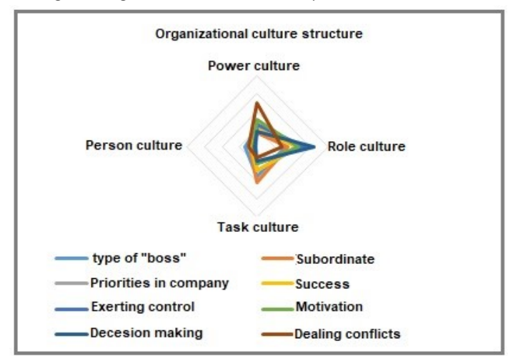
Figure 1: Organizational culture structure by all examined dimensions

Graphic presentation of organizational culture structure by all examined dimensions is shown in Figure 1.